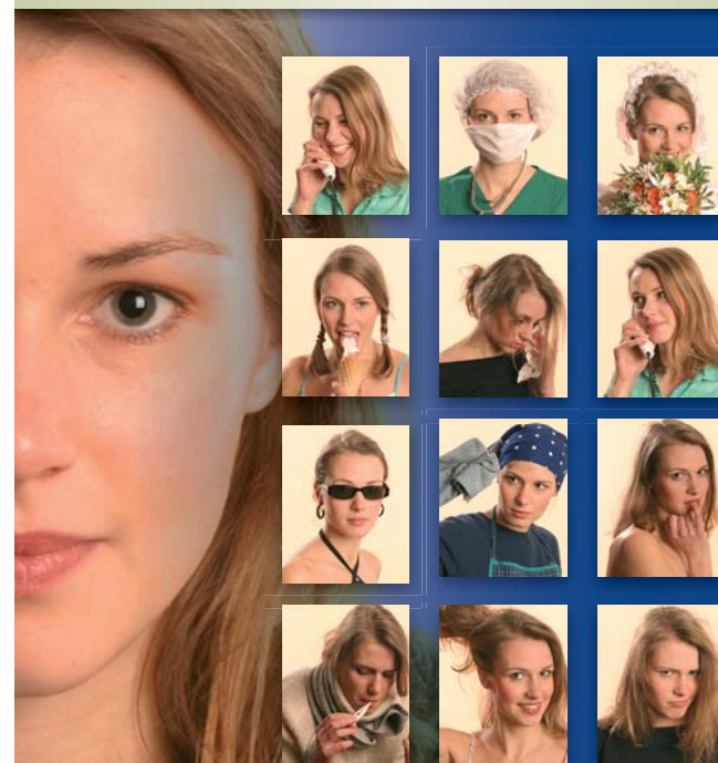
GESTALTUNG: EYEKEY DESIGN